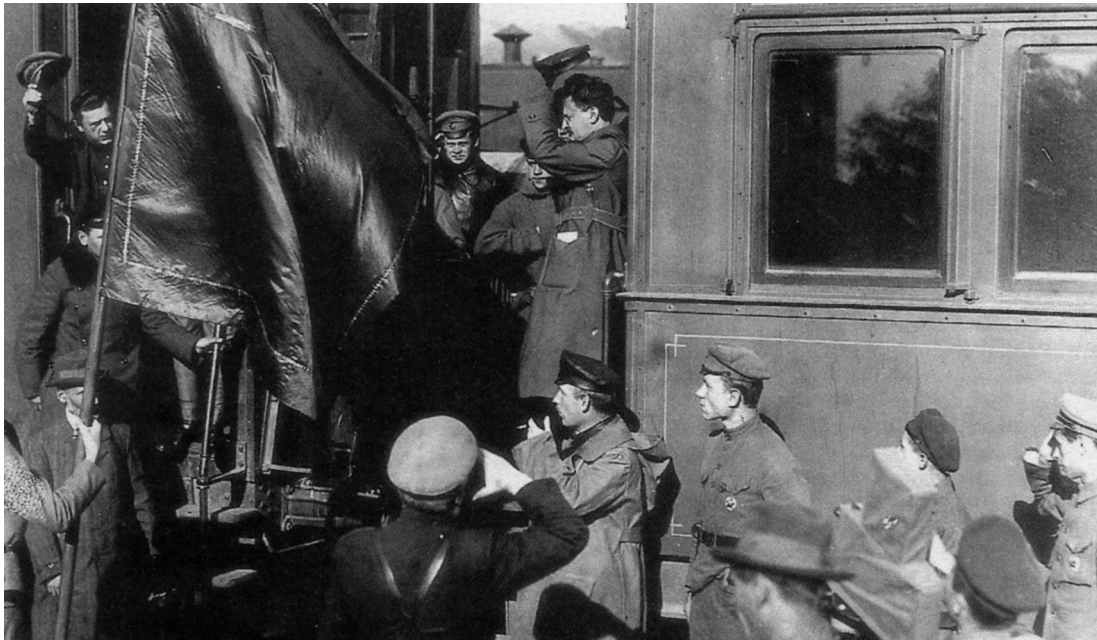
Trotsky arriving in his special train. He was visiting his front line soldiers during the Civil War.

11 Study the photograph, and then answer the questions which follow.